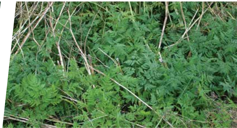
Chervil covering ground.