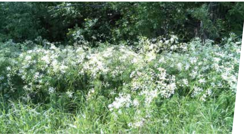
Chervil in flower.

For more information about effective vegetation management, contact your Bayer representative or visit es.bayer.ca