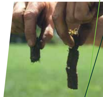
Pythium root rot reduces root mass in cool or hot, and wet conditions.