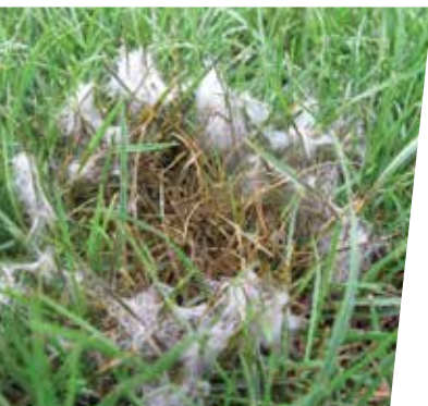
Prolific aerial mycelium is a characteristic sign of Pythium blight.