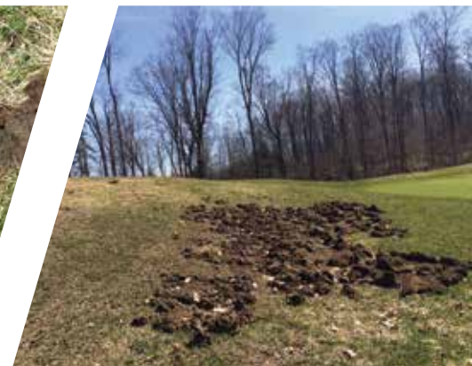
(L) Stressed turf as a result of white grub activity. (C) Due to lack of root system, turf easily peels back to reveal white grubs. (R) Turf damage in area infested with white grubs due to foraging animals such as skunks and raccoons.