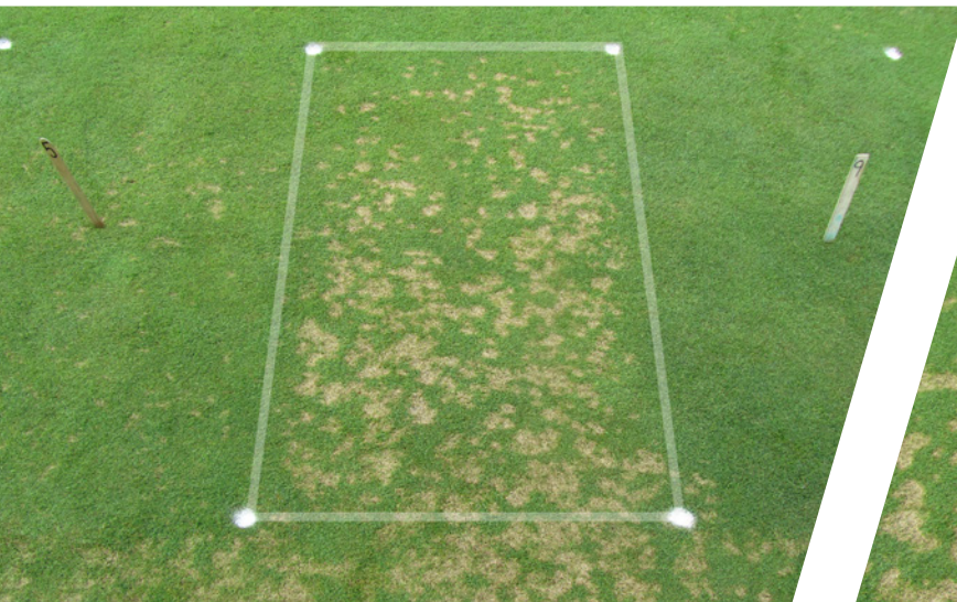
Control Photo: Dr. Paul Giordano - Bayer

See Exteris Stressgard label for complete reference on control options and applications instructions. Always read and carefully follow label instructions.